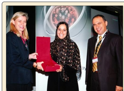
Oracle Business Excellence Award Year 2004