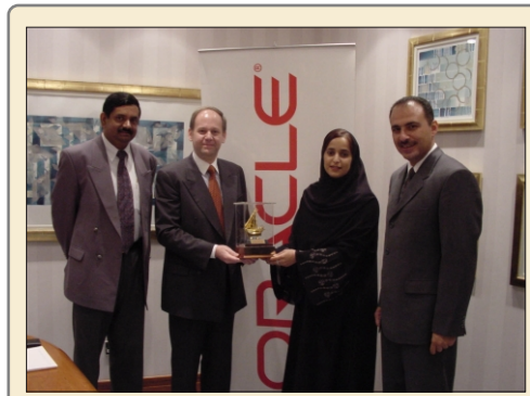
Oracle's "Lead e-Commerce Partner" Award Year 2000